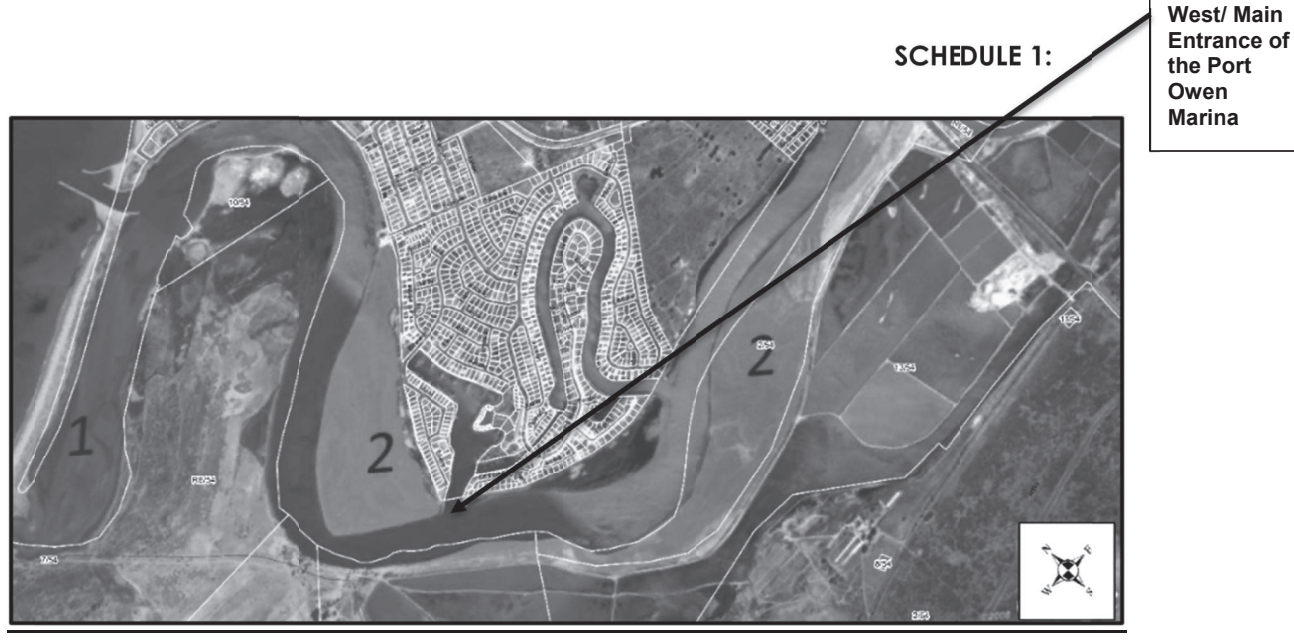
Zone 1 - Old Mouth Lagoon – Covering the water area and salt marshes stretching upstream towards to Zone 2